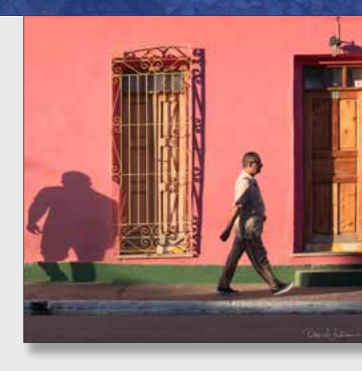
Tell the Stories of Cuba

Once we arrive in Baracoa, we check in, refresh and wander with our cameras to capture late afternoon light and color. Dinner is together at a recommended restaurant that offers local seafoods and other fare. Tonight holds an option to wander the streets with Dave and a local guide, or alone to capture local flavor in B&W.