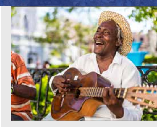
Feel the Rhythms of Cuba

Breakfast and check out of our casas. Say goodbye to our Cuban hosts and transfer to Santiago's airport to check in for your return flight to USA.