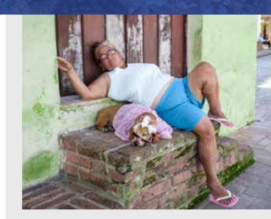
Find a New Friend in Cuba

We then take a scenic drive to El Morro to learn of its historic significance, where we can explore and lunch at the Restaurante el Morro where you'll enjoy classic Cuban cuisine in a spectacular cliff-side location with its expansive sea views.