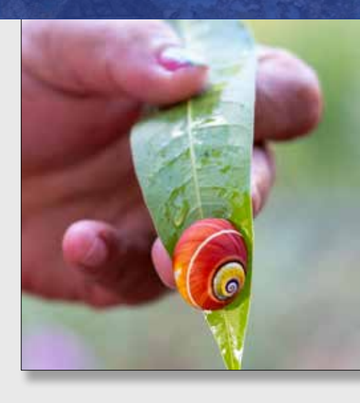
Capture the Colors of Cuba

After dinner, pack and relax, or hit the streets to enjoy night photography in town.